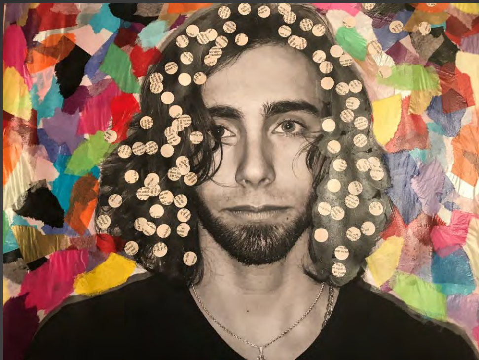
ME MIXED MEDIA 18X24