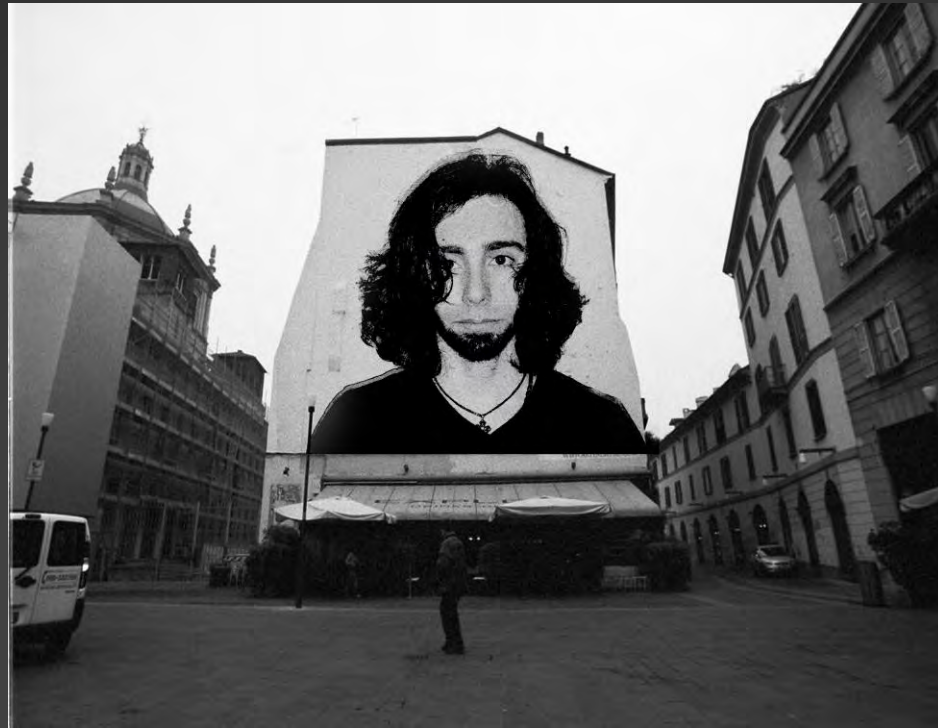
UNTITLED PHOTOGRAPHY 8.5X11