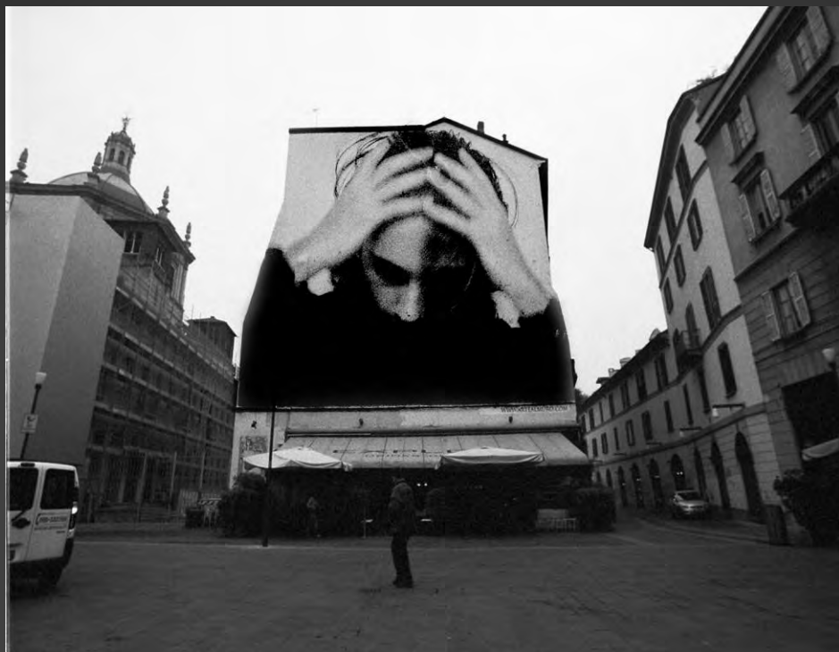
UNTITLED PHOTOGRAPHY 8.5X11